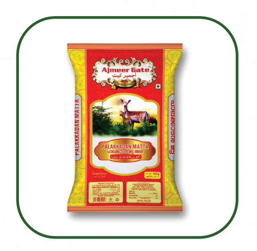
Palakkadan Matta Rice