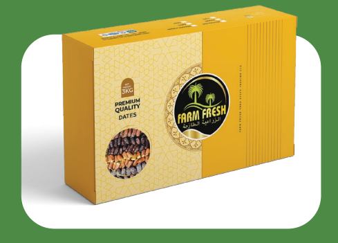
Premium Mixed Dates

Our dates are carefully harvested, naturally ripened, and meticulously packed to preserve their freshness and nutritional value.