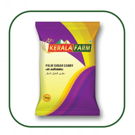
Palm Sugar Candy