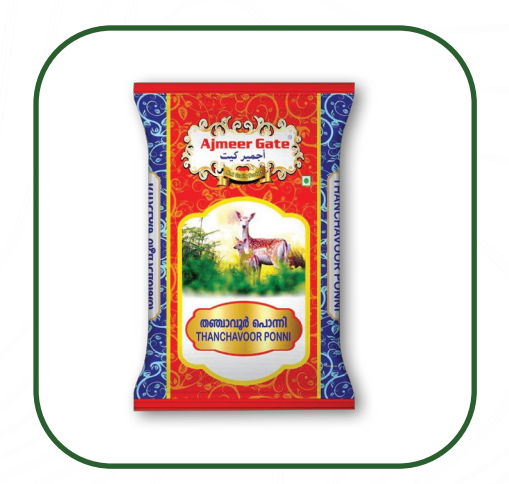
Thanchavoor Ponni Rice