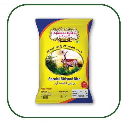
Special Biriyani Rice

we believe in delivering the finest rice, ensuring every meal is a celebration of authentic flavors. Whether for daily consumption or gourmet cooking, Ajmeergate rice guarantees excellence in every bite.