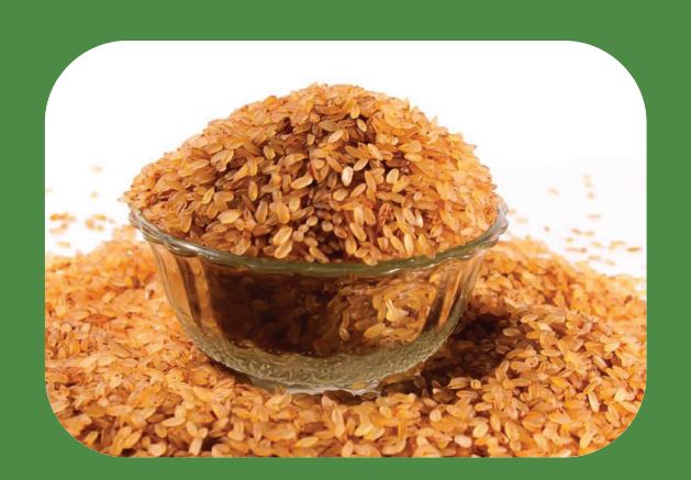
Palakkadan Matta Rice

Palakkadan Matta Rice, also known as Kerala Red Rice or Rosematta Rice, is a unique variety of rice grown in the Palakkad district of Kerala, India. It is known for its distinctive red color, coarse texture, and rich, earthy flavor. This rice is widely used in South Indian cuisine, particularly in Kerala, and is a staple for many traditional dishes.