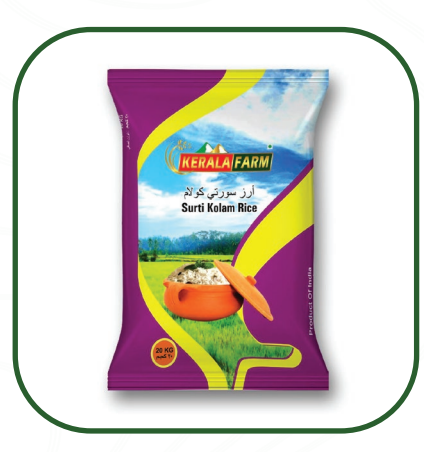
Surti Kolam rice